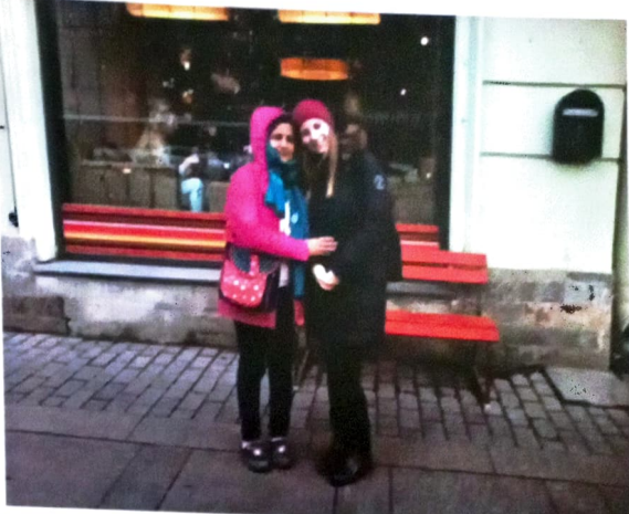
In Russia With the students in a round trip