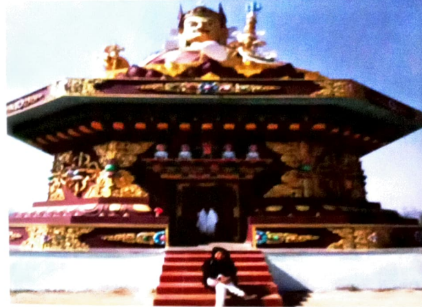
With the memory of CUTM conference