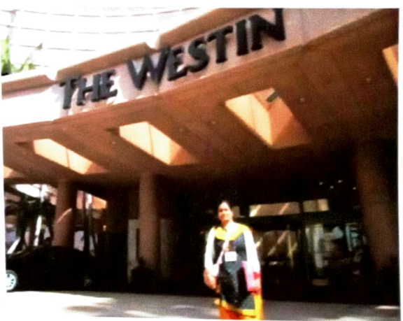
The venue of AGHE conference