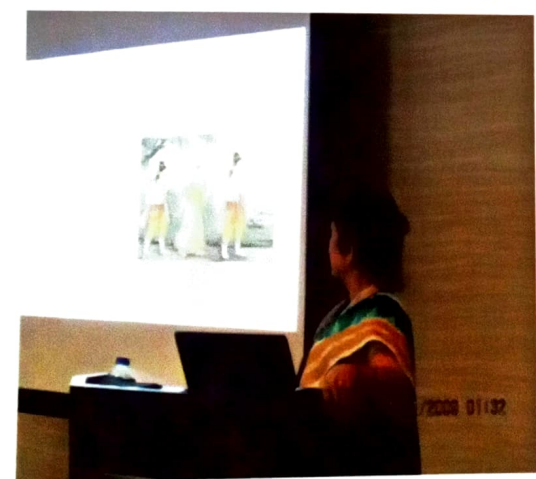
Paper Presentation in AGHE, at CA, USA