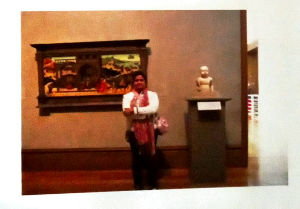
In Museum California