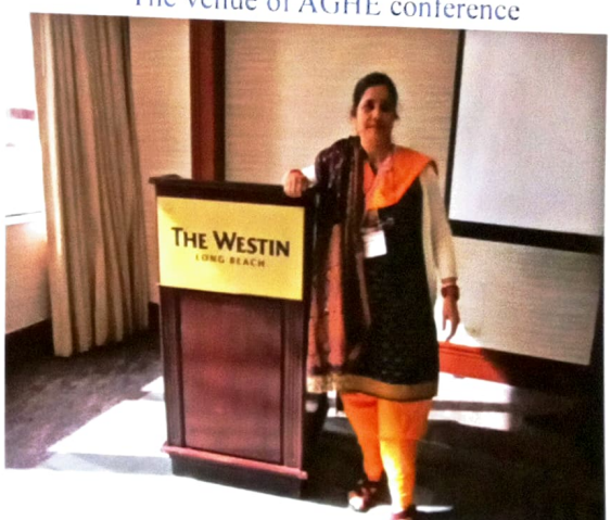
Presenting paper in AGHE conference al California .