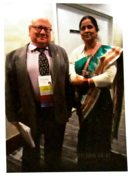
With secy, American Psychology Association