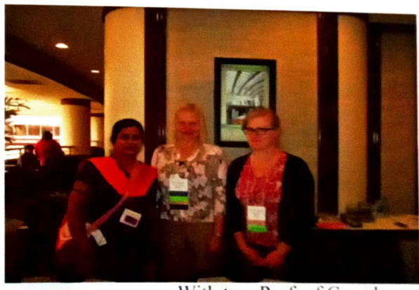
With two Prof. of Canada