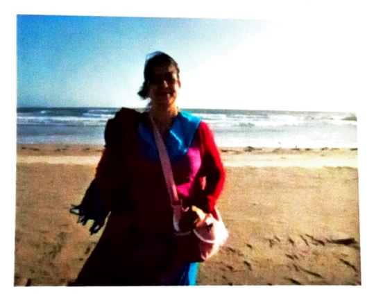
On the sea beach of California