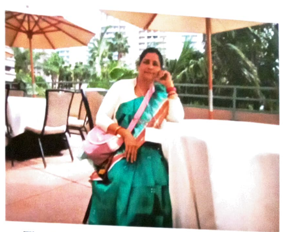
The famous Westin, Long Beach, California, The venue of AGHE conference