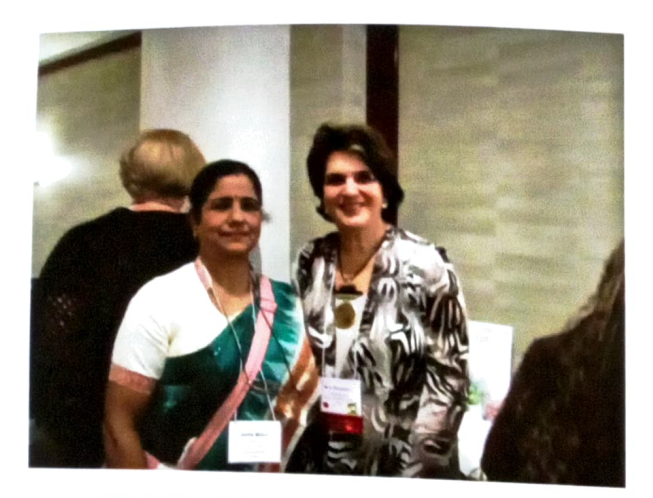
With President of G.C.P in California